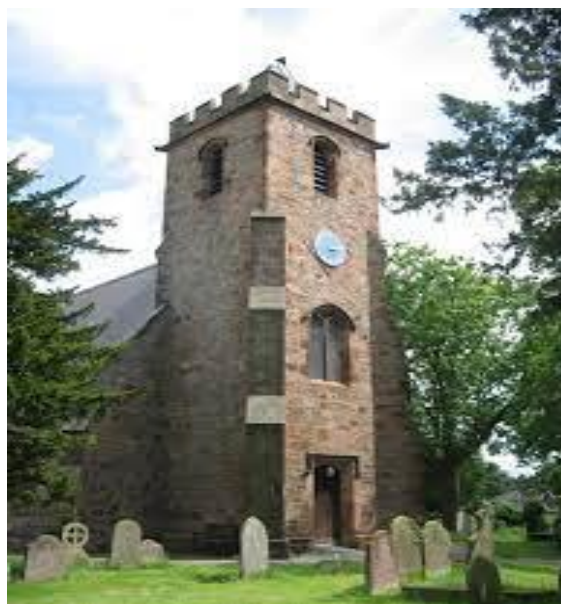
St Mary's Church, Broughton